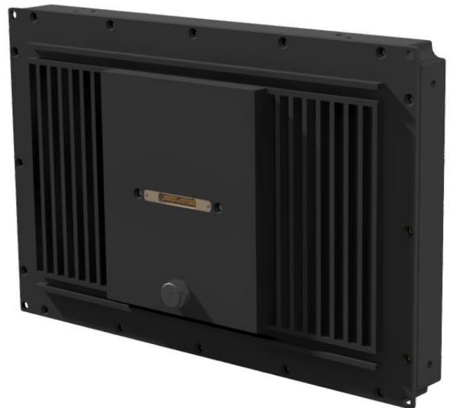
Figure 2 - LCD Module Back.