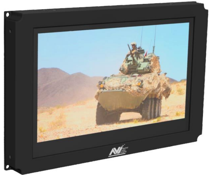
Figure 1 - LCD Module Front.

facilitates various options for mounting the LCD Module in tight locations or on articulated display mounts.