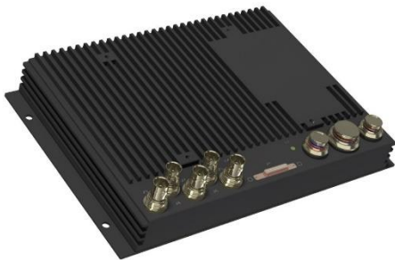
Figure 3 – Display Electronics Module.

The DEU contains the LCD driver, DC/DC converter and video processors. Connection to the LCD Module is via an AVI provided Embedded DisplayPort (eDP) cable. The DEU can be placed up to 2 meters (6.5') from the LCD Module. This